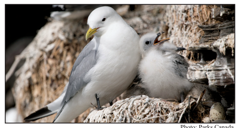
The black-legged kittiwakes – not to be confused with gulls - live at sea, and come to land only for the nesting period.

It will be a good thing, said Mr. Marchand, because several typical elements of Forillon, such as the marine birds, geology and arctic-alpine plants, can be better appreciated from the sea.