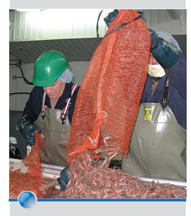
FTQ fund invested $1.2 M on the Gaspé